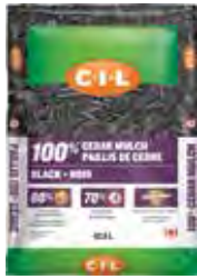
C-I-L® 100% Black Cedar Mulch