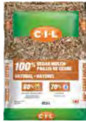
C-I-L® 100% Natural Cedar Mulch