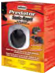
WILSON® PREDATOR® Sonic-Repel™