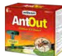
WILSON® AntOut® Outdoor Ant Stakes