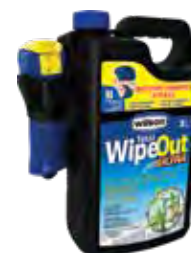
WILSON® Total WipeOut® Ultra™ Battery powered