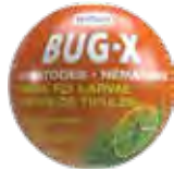
WILSON® BUG-X® Leatherjacket Nematodes