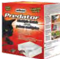
WILSON® PREDATOR® Multiple Catch Mouse Trap CODE: 7 74035 0 SIZE: 1 trap