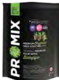
PRO-MIX® Organic Seed Starting Mix