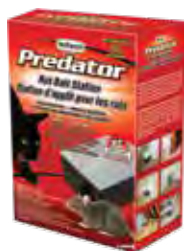
WILSON® PREDATOR® Rat Bait Station CODE: 7 74105 0 SIZE: 1 station