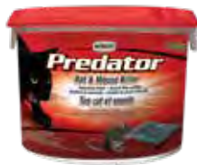
WILSON® PREDATOR® Rat & Mouse Pellets CODE/SIZE: 7 74011 0 (360 g), 7 74012 0 (720 g)