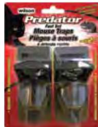
WILSON® PREDATOR® Fast Set Mouse Traps