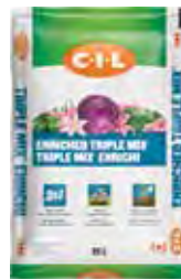
C-I-L® Enriched Triple Mix®