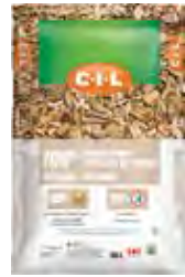
C-I-L® 100% Natural Cedar Chips