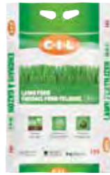
C-I-L® Lawn Food 30-0-3

CODE/SIZE: 2 31540 1 (5.25 kg), 2 31541 1 (10.5 kg)