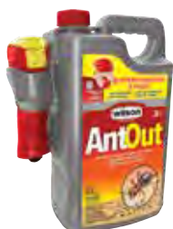
WILSON® AntOut® Battery powered