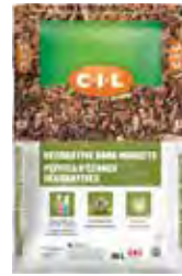
C-I-L® Decorative Bark Nuggets