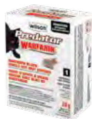
WILSON® PREDATOR® WARFARIN™ Mouse Bait Station CODE/SIZE: 7 70553 0 (1 station) 7 70554 0 (3 stations)