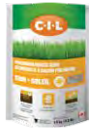
C-I-L® Premium Sun Grass Seed