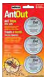
WILSON® AntOut® Ant Traps – 3 Pack