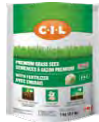
C-I-L® Premium Grass Seed & Fertilizer 02-05-02

CODE/SIZE: 2 33807 0 (1 kg), 2 33808 0 (2 kg)