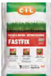
C-I-L® FASTFIX® Patch & Repair 9-1-1

CODE/SIZE: 2 33807 0 (1 kg), 2 33808 0 (2 kg)