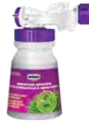
WILSON® Nematode Sprayer