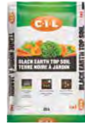
C-I-L® Black Earth Top Soil