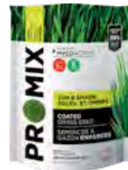
PRO-MIX® Sun & Shade

CODE/SIZE: 4 94520 0 (1 kg) 4 94521 0 (2 kg)