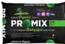
PRO-MIX® Organic Lawn Soil