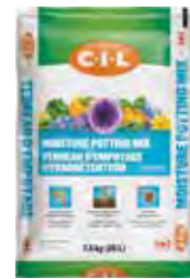
C-I-L® Moisture Potting Mix