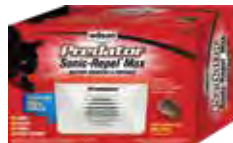
WILSON® PREDATOR® Sonic-Repel™ Max Battery