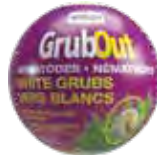
WILSON® GrubOut® Nematodes