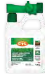
C-I-L® Liquid Lawn Food 30-0-0