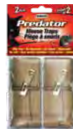
WILSON® PREDATOR® Wood Mouse Traps

CODE/SIZE: 7 74045 0 (2 traps), 7 74046 2 (12 traps)