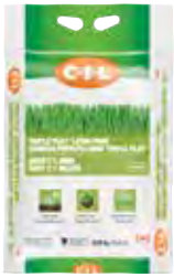
C-I-L® Triple Play™ Lawn Food 33-0-3

CODE/SIZE: 2 31540 1 (5.25 kg), 2 31541 1 (10.5 kg)