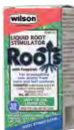
WILSON® ROOTS® Liquid Stimulator CODE: 7 90684 2 SIZE: 50 ml