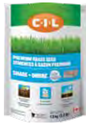
C-I-L® Premium Shade Grass Seed