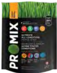
PRO-MIX® Ultimate All Condition