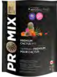
PRO-MIX® Cactus Mix