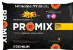
PRO-MIX® Garden Mix