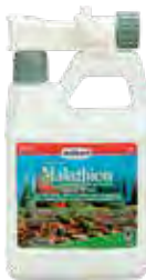
WILSON® Malathion Insecticide Attach & Spray