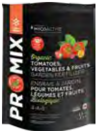
PRO-MIX® Organic Tomatoes, Vegetables & Fruits 4-4-8