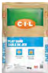
C-I-L® Play Sand