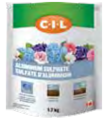
C-I-L® Aluminum Sulphate