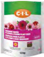
C-I-L® Organic-based Flower & Bloom Plant Food 6-14-8