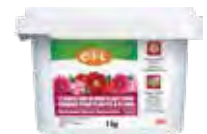
C-I-L® Flower and Bloom Plant Food 15-30-15