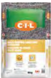
C-I-L® Multi-Purpose Limestone Screening