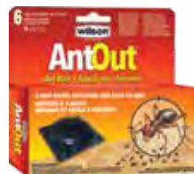
WILSON® AntOut® Ant Bait