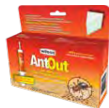
WILSON® AntOut® Ant Bait Gel