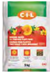
C-I-L® Organic-based All Purpose Plant Food 10-10-10