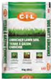
C-I-L® Enriched Lawn Soil

CODE/SIZE: 2 80756 1 (15 L), 2 80757 1 (25 L)