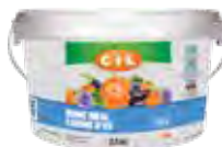
C-I-L® Bone Meal 4-10-0