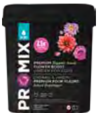
PRO-MIX® Organic-based Flower Boost 12-28-12