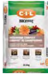
C-I-L® BIOMAX™ Mushroom Compost