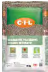
C-I-L® Decorative Pea Gravel