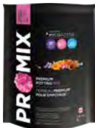
PRO-MIX® Potting Mix

Code/Size: 4 98012 0 (5 L), 4 98011 0 (9 L)