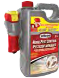
WILSON® Home Pest Control Battery powered