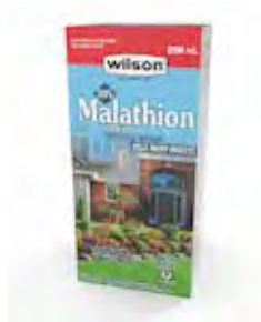
WILSON® Malathion Insecticide Concentrate

CODE/SIZE: 7 30281 0 (250 ml), 7 30282 0 (500 ml)