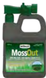
WILSON® MOSSOUT® with Lawn Food 5-0-0 CODE/SIZE: 7 20209 0 (2.5 kg), 7 20209 2 (2.5 kg), 7 20210 2 (5 kg)