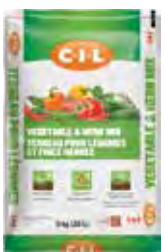
C-I-L® Vegetable & Herb Mix