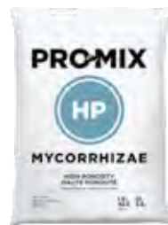
PRO-MIX® HP Mycorrhizae™

CODE/SIZE: 4 92015 1 (42.5 L), 4 92038 1 (3.8 cu. ft.)