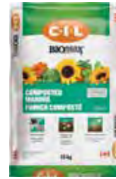
C-I-L® BIOMAX™ Composted Manure