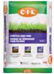
C-I-L® Starter Lawn Food 10-20-5