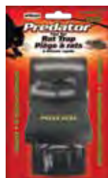
WILSON® PREDATOR® Fast Set Rat Trap