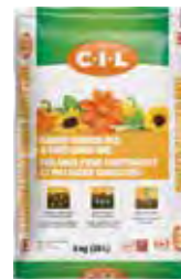
C-I-L® Raised Garden Bed & Container Mix