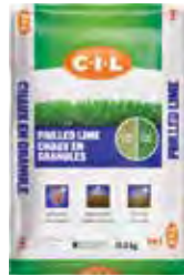
C-I-L® Prilled Lime