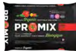
PRO-MIX® Organic Vegetable and Herb Mix

CODE/SIZE: 4 98140 1 (28.3 L), 4 98170 1 (2 cu. ft.)