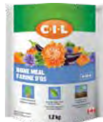
C-I-L® Bone Meal 4-10-0