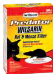
WILSON® PREDATOR® WILSARIN® Rat & Mouse Killer CODE/SIZE: 7 70587 0 (360 g), 7 70588 0 (900 g)