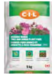
C-I-L® Organic-based Tree and Shrub Plant Food 18-8-8