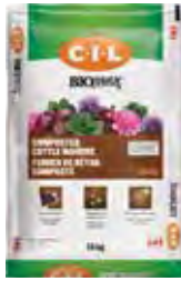
C-I-L® BIOMAX™ Composted Cattle Manure