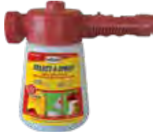
WILSON® SELECT-A- SPRAY® Lawn & Garden Sprayer