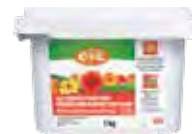
C-I-L® All Purpose Plant Food 20-20-20