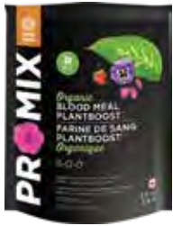
PRO-MIX® Organic Blood Meal PlantBoost™ 8-0-0