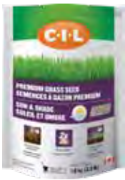
C-I-L® Premium Sun & Shade Grass Seed

CODE/SIZE: 2 33801 0 (1.5 kg), 2 33802 0 (4 kg)