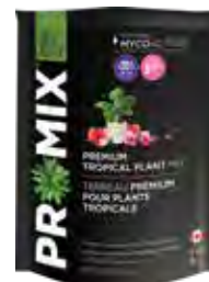
PRO-MIX® Tropical Plant Mix

CODE/SIZE: 4 98092 0 (5 L), 4 98091 0 (9 L)