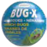
WILSON® BUG-X® Chinch Nematodes