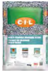
C-I-L® Multi-Purpose Drainage Stone