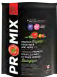
PRO-MIX® Organic Vegetable and Herb Mix

Code/Size: 4 98012 0 (5 L), 4 98011 0 (9 L)