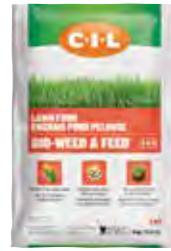
C-I-L® BIO-WEED & FEED™ 9-0-0

CODE/SIZE: 2 32550 1 (6kg), 2 32551 1 (12kg)