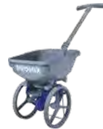
PRO-MIX® Premium Spreader