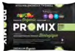
PRO-MIX® Organic Moisture Mix