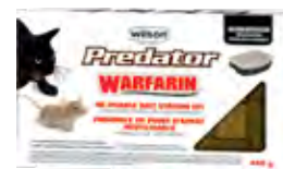
WILSON® PREDATOR® WARFARIN™ Re-usable Mouse Bait Station Kit CODE: 7 70552 0 SIZE: 1 kit