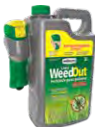
WILSON® Lawn WeedOut® Ultra™ Battery powered