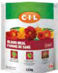
C-I-L® Blood Meal 12-0-0