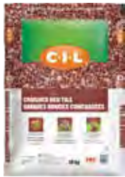
C-I-L® Crushed Red Tile