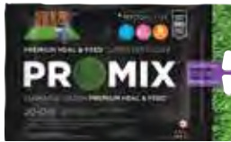
PRO-MIX® Heal & Feed™ Lawn Fertilizer 20-0-5