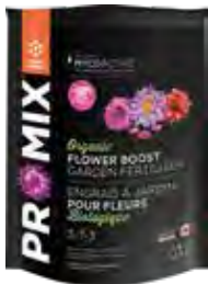
PRO-MIX® Organic Flower Boost 3-7-3