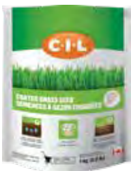
C-I-L® Coated Grass Seed

CODE/SIZE: 2 33859 0 (1 kg), 2 33844 0 (2 kg), 2 33845 0 (5 kg), 2 33846 1 (10 kg), 2 33847 1 (25 kg)