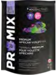
PRO-MIX® African Violet Mix