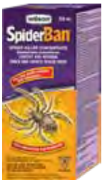
WILSON® SPIDERBAN® Concentrate