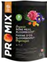
PRO-MIX® Organic Bone Meal BloomBoost™ 4-7-0