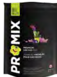
PRO-MIX® Orchid Mix

CODE/SIZE: 4 98092 0 (5 L), 4 98091 0 (9 L)