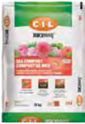
C-I-L® BIOMAX™ Sea Compost