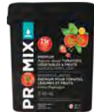
PRO-MIX® Organic-based Tomatoes, Vegetables & Fruits 9-16-16