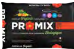
PRO-MIX® Organic Container Mix

CODE/SIZE: 4 98013 1 (18 L), 4 98014 1 (28.3L), 4 98015 1 (56.6 L), 4 98160 1 (2 cu. ft.)