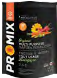
PRO-MIX® Organic Multi-Purpose 7-3-3