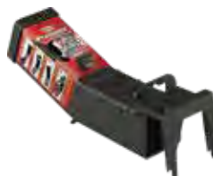
WILSON® PREDATOR® TIP TRAP™