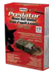
WILSON® PREDATOR® Mouse Bait Station CODE/SIZE: 7 74006 0 (1 station), 7 74007 0 (4 stations)