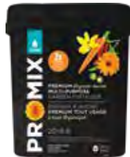
PRO-MIX® Organic-based Multi-Purpose 20-8-8