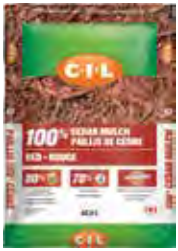
C-I-L® 100% Red Cedar Mulch