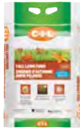
C-I-L® Fall Lawn Food 12-0-18

CODE/SIZE: 2 30558 1 (6 kg), 2 30560 1 (25 kg)