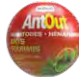
WILSON® AntOut® Nematodes