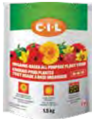
C-I-L® Organic-based All Purpose Plant Food 10-10-10