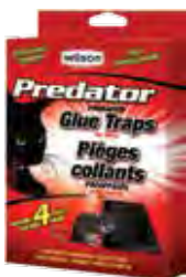
WILSON® PREDATOR® Mice Glue Traps