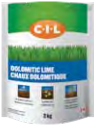
C-I-L® Dolomitic Lime