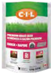
C-I-L® Premium Quick Grass Seed

CODE/SIZE: 2 33801 0 (1.5 kg), 2 33802 0 (4 kg)