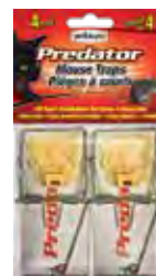
WILSON® PREDATOR® Wood Mouse Traps with Plastic Cheese

CODE/SIZE: 7 74045 0 (2 traps), 7 74046 2 (12 traps)