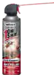
WILSON® ONE SHOT™ Jet Foam Ant Killer