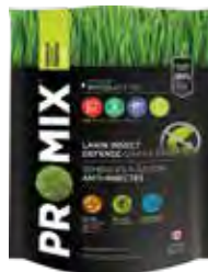
PRO-MIX® Lawn Insect Defense