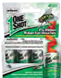
WILSON® ONE SHOT™ Fly Ribbon