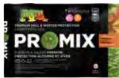
PRO-MIX® Fall & Winter Protection Lawn Fertilizer 10-0-32