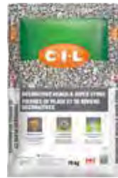
C-I-L® Decorative Beach & River Stone