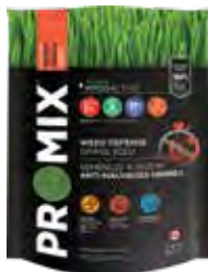
PRO-MIX® Weed Defense