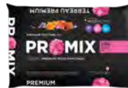
PRO-MIX® Potting Mix

CODE/SIZE: 4 98140 1 (28.3 L), 4 98170 1 (2 cu. ft.)