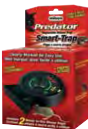
WILSON® PREDATOR® Smart-Trap™ CODE: 7 74049 0 SIZE: 2 traps