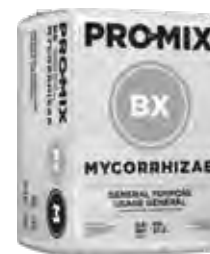
PRO-MIX® BX Mycorrhizae™

CODE/SIZE: 4 92015 1 (42.5 L), 4 92038 1 (3.8 cu. ft.)