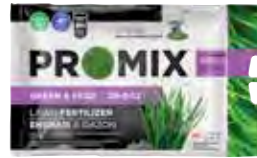
PRO-MIX® Green & Feed™ Lawn Fertilizer 36-0-12