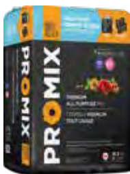
PRO-MIX® All Purpose Mix